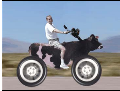
Above: The author surveying the Udder route on his fuel-efficient Cowasaki, AKA The Uddermobile

Who would ever have thought that Union would experience gridlock early on a Sunday morning? No, it wasn't an appearance by Thomas the Tank Engine at the Railway Museum, but the 26 th Annual Udder Century. Both Rte 20 and South Union Road were backed up as anxious riders were waiting to be guided to parking areas at Donley's. On this momentous day, 1,585 cyclists from 8 states hit the road riding between 31 and 100 miles. What a beautiful day for an Udder.